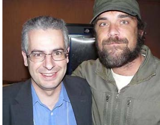
From The Sun (3 rd May, 2008)