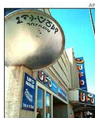
Roswell has attracted UFO enthusiasts for decades

People who haven't seen things tend to be total sceptics and call me a crackpot. But I'm a pretty level-headed sort of guy and I don't drink or take drugs.