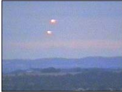
The cameraman spotted flashing lights in the sky.