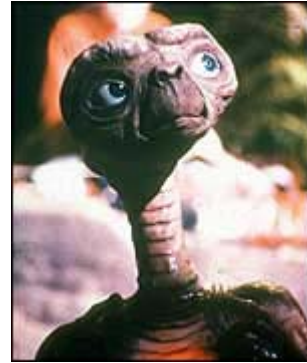
What if E.T. came home?

"We all believe there's something strange, whether it be government or UFO. I reckon we'll never really find out what's out there".