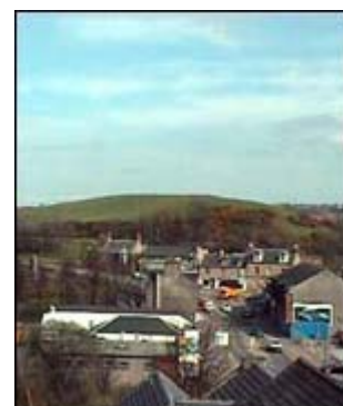
Bonnybridge: A remote spot to alien watch